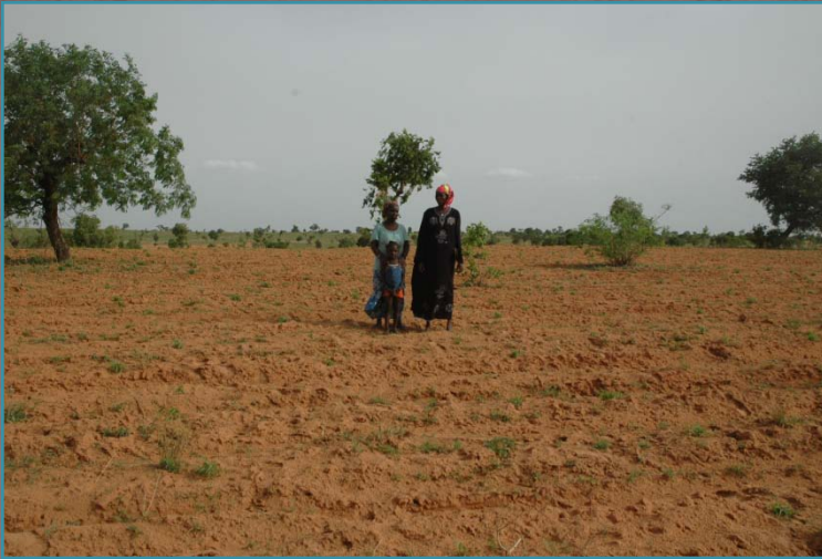
1. President (right) and Vice President (left) of the cooperative Bodjina Baara in their field of millet in Amassagou