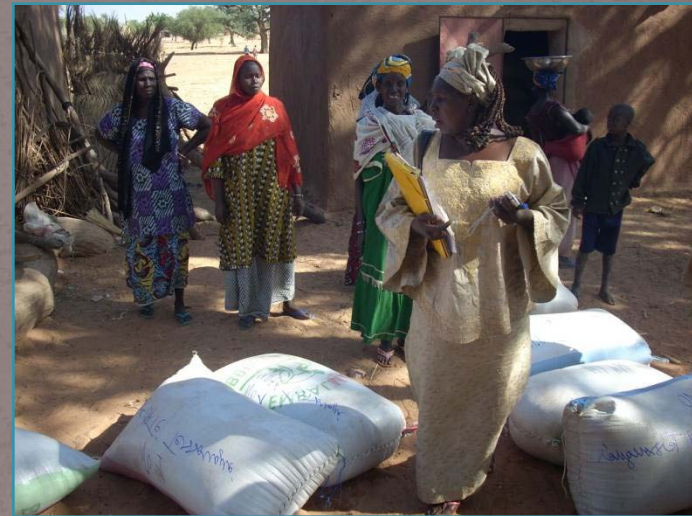
3. Signing of contracts with Women's cooperative from Logo, Mopti